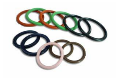
Product No.Part-08 Sealing